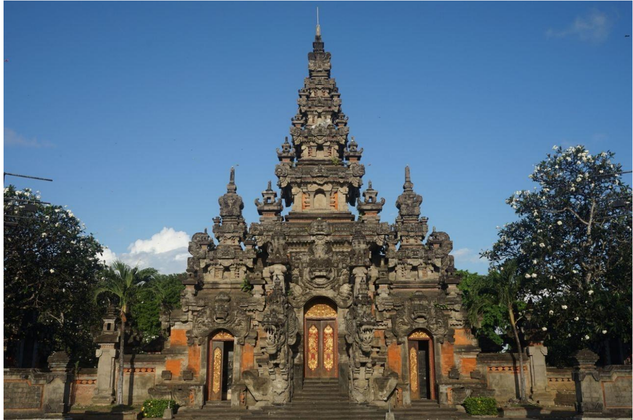
The 23 rd World Congress for Bronchology and Interventional Pulmonology (WCBIP) in Conjunction with National Congress of Indonesian Society of Respirology (ISR)